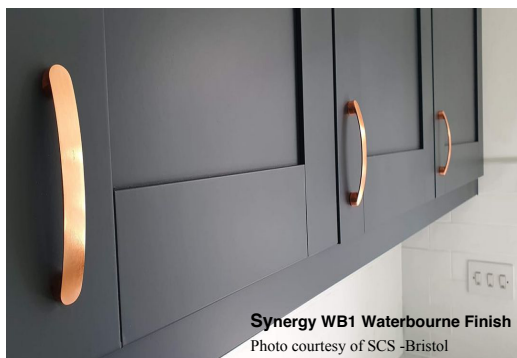
Synergy WB1 Waterbourne Finish